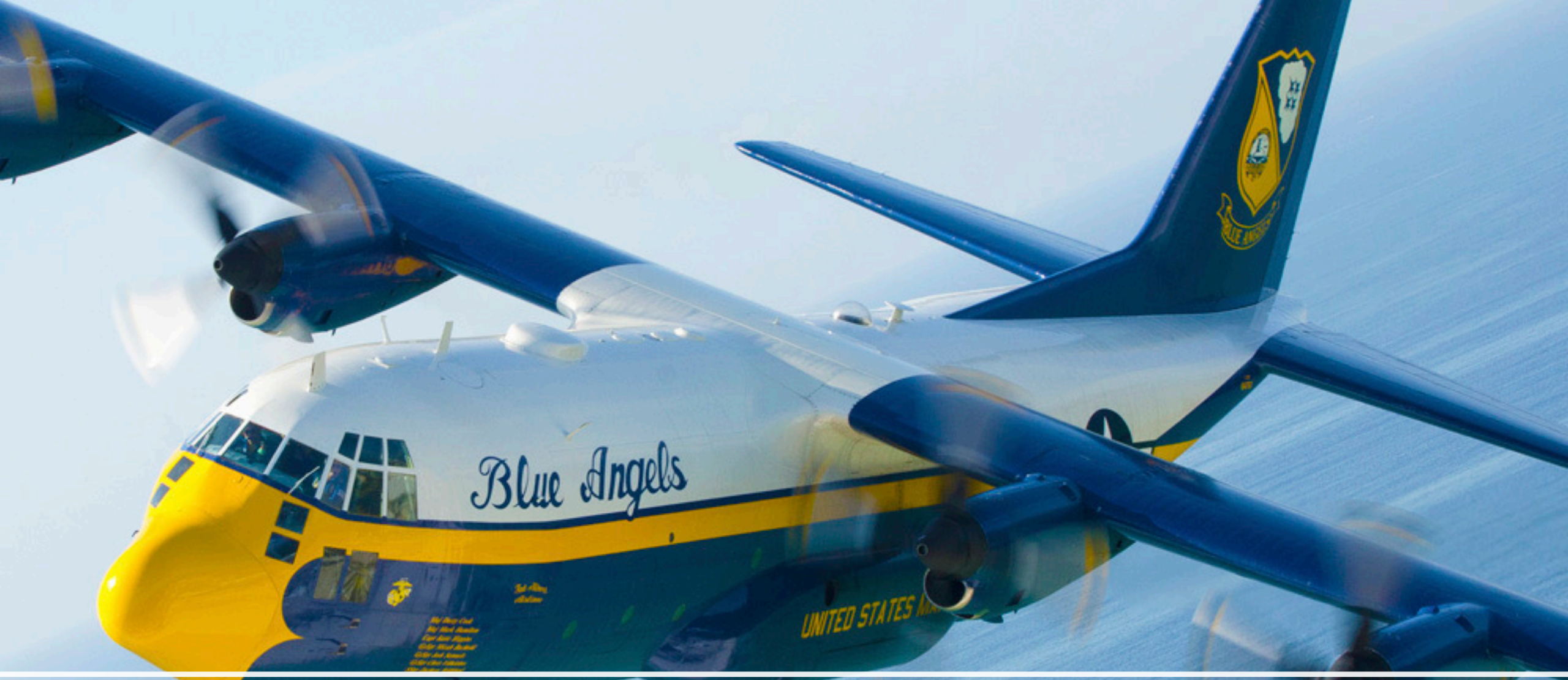
U.S. Marine Corps C-130 "Fat Albert"