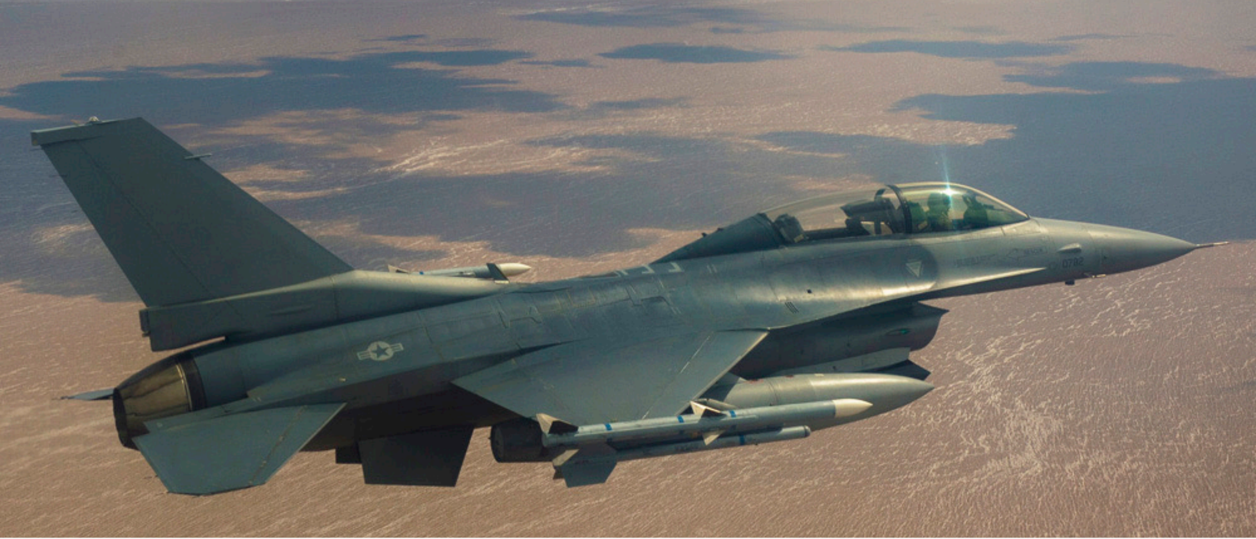
U.S. Air Force F-16 Viper Demo Team