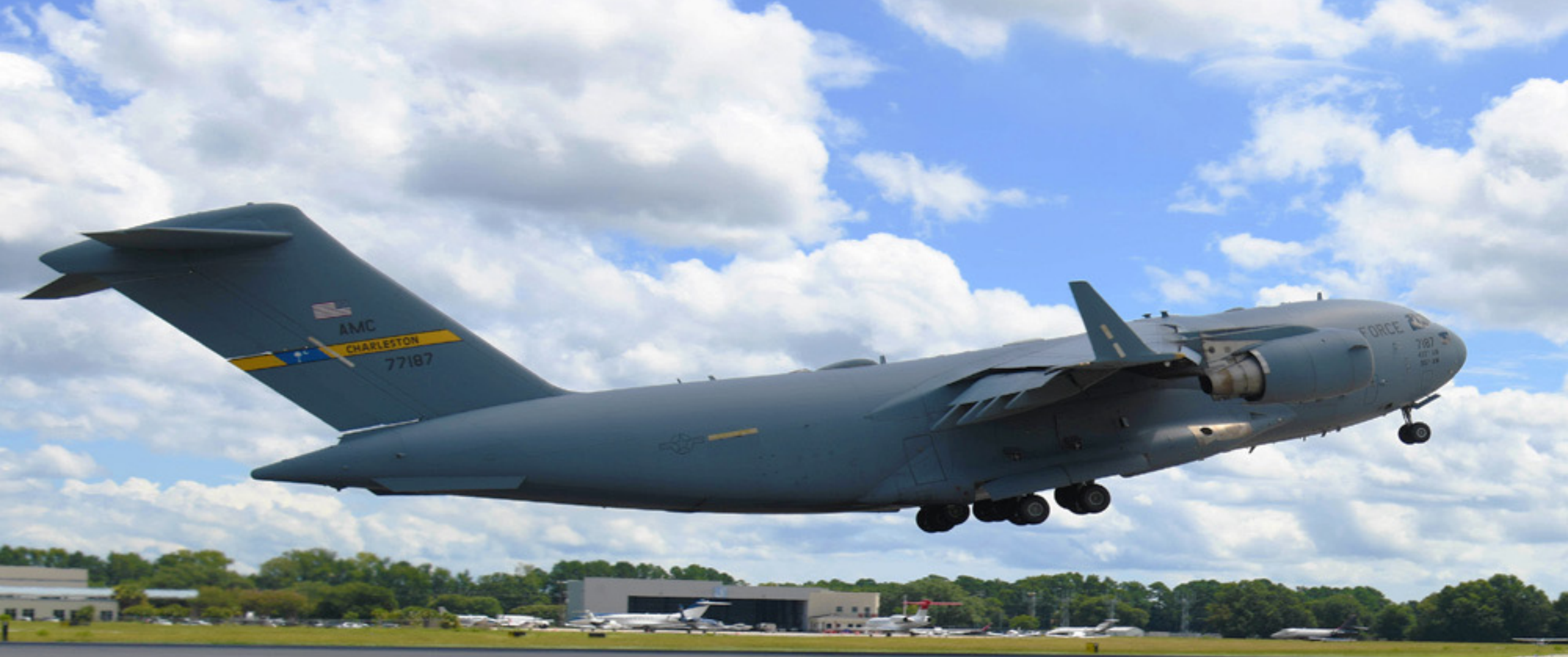
U.S. Air Force C-17 Globemaster III